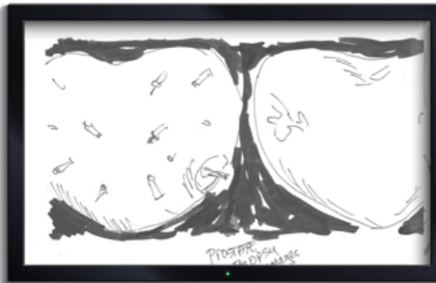
310: Prostate biopsy images Location: Talent:

Voice Over: We're also diagnosing bladder cancer at its earliest stages