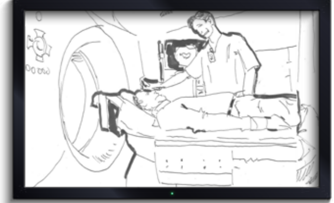
309: Patient going into MRI (stock) Location: Talent: