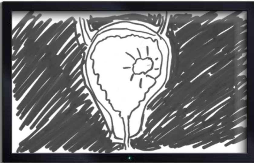
313: Close-up of images on screen showing tumor glowing Location: Memorial OR Talent: Dr. Deem

Voice Over: for quicker detection and removal.