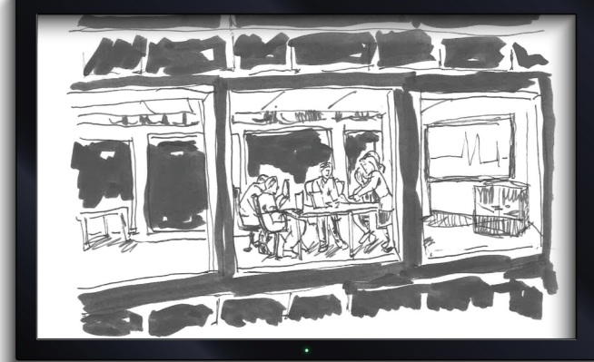
211 (CU): Physicians reviewing cases Location: Community room exterior Talent: Hem Onc, Rad Onc, Elmore, Bush II