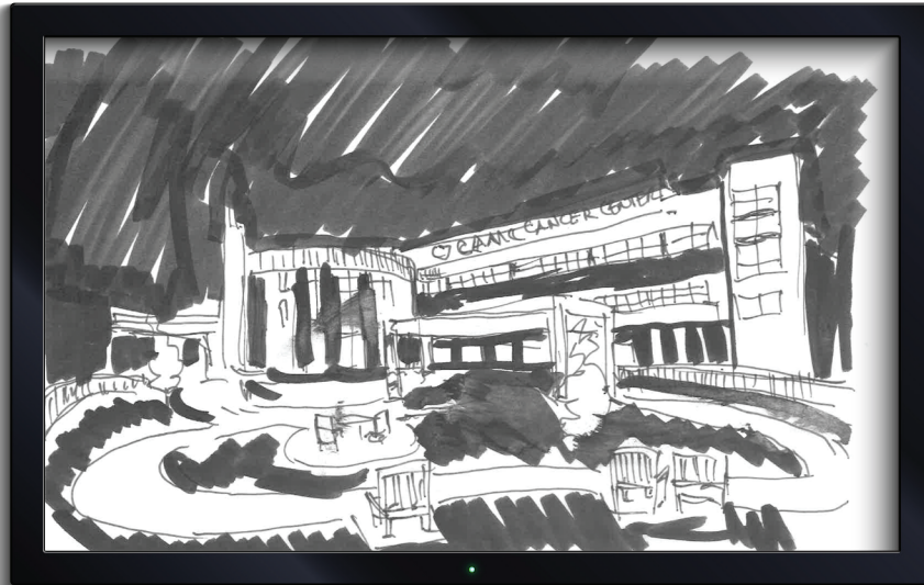
212 (WIDE): Exterior (night) Location: Cancer Center ext. Talent: