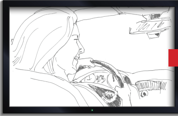
202: Bev parking Location: Parking lot Talent: Bev