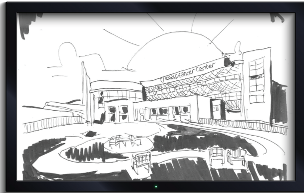
201: Exterior (early morning) Location: Ext. Cancer Center Talent: