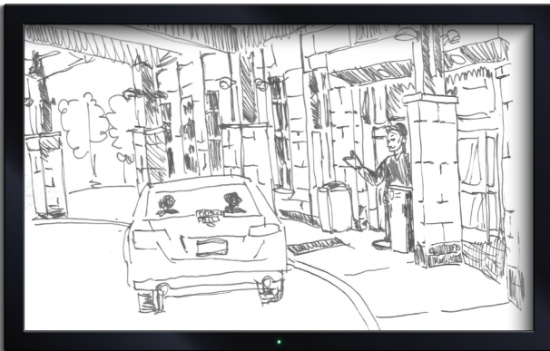
203: Greeters at door Location: Main entrance Talent: Daner and Charlie with pt. (volunteer); welcome desk (Wanda Hightower)

Voice Over: And the moon is the only light we see.