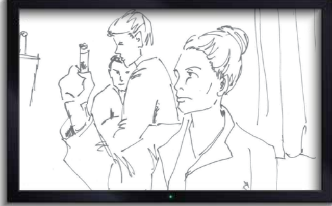
112: Lab tech looking at test tube Getty video Talent: Lab tech

Voice Over: CAMC. We research the possibilities,