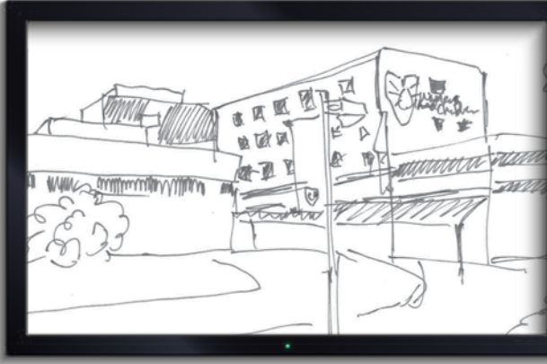
111: WCH ext. Location: WCH Talent:

Voice Over: at an academic medical center.