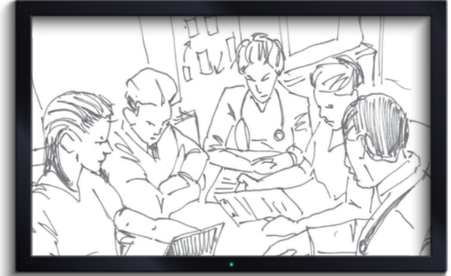
109: Overhead shot of table (busy white coats/researchers) Location: H&V LCR Talent: Crew, M&PA Staff

Voice Over: and procedures, research, clinical trials