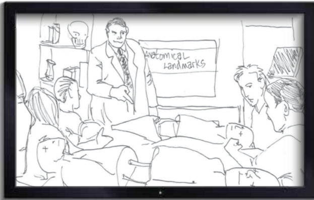
107: Dr. Edwards and med students in classroom Location: existing footage (Image) Talent: existing footage (Image)

Voice Over: physicians, nurses and other clinical providers.