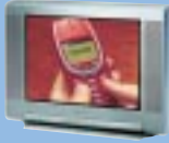
(SONY® FLAT-SCREEN TV)